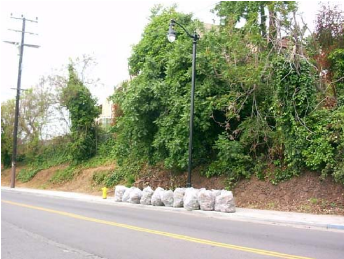
This Much Trash Removed

What better way to take ownership of your community than by caring for it? A great example is our Beautification efforts on the first Saturday of every month along Marmion Way. The smiling faces of people working and talking with neighbors as they pick up trash may confuse some passers-by. But the line-up of trash bags on the sidewalk clearly advertises to the larger community that people in Mount Washington care, and that having trash or beauty is a choice.