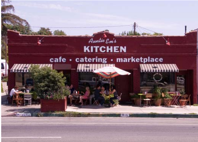
Auntie Em's on Eagle Rock Boulevard

Auntie Em's serves breakfasts and lunches with an emphasis on fresh ingredients. The breakfast fare is particularly notable, with a good selection of egg dishes, pancakes and French toast, frequent specials and wonderful offerings of apple smoked bacon, Cajun turkey sausage and, most especially, great cheeses.