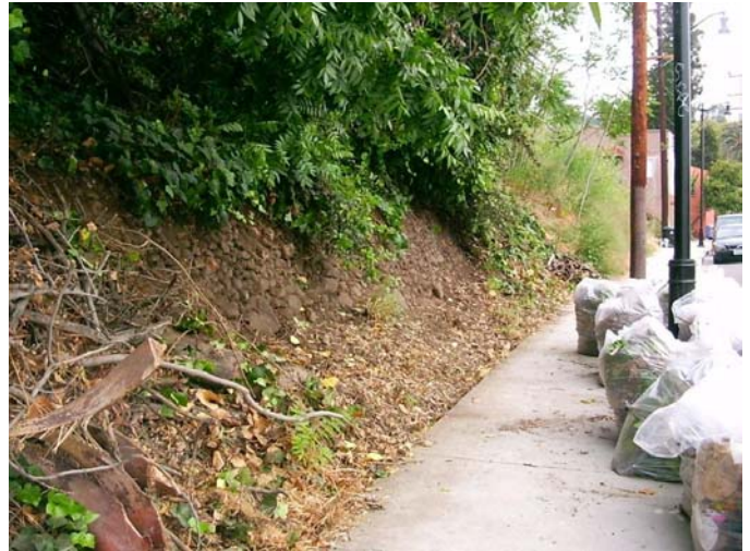
The Wall on Marmion Way

It's no accident that Mount Washington has been beneficiary of these and many other improvements. Although we are privileged to be positioned within a rare setting of natural beauty, we also have a community full of activists who enjoy getting together to work, and sometimes fight, to preserve and enhance the natural beauty and cultural resources of this place we call home.